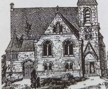
Above: Kaltenholzhausen Church sketch. Note the tower and clock on the righthand side.

Zeugnis des geistigen und künstlerischen Schaffens im ausgehenden 19. Jhd. An der Erhaltung und Pflege besteht aus wissenschaftlichen und städtebaulichen