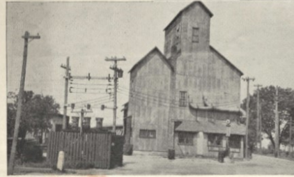
The bottom picture shows the Central Erie Exchange at Front, Erie County. Equipment "with a fence around it" at the left of the picture will generate 400 H. P. for running the elevator machinery.