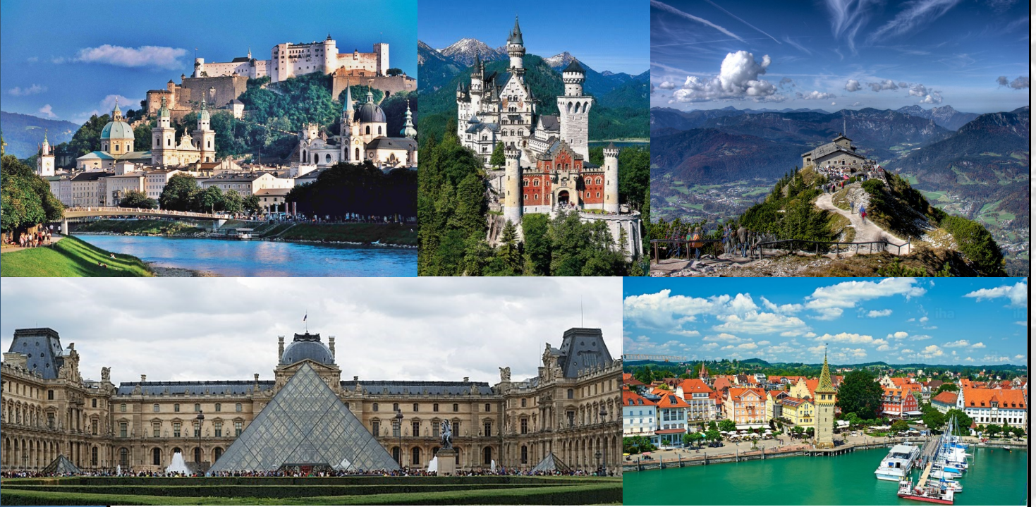
Pictures: Top Row L to R: The city of Salzburg, Austria, Neuschwanstein Castle, The Eagle's Nest (Hitler's Mountain Retreat) Bottom Row L to R: The Louvre Palace and Museum, Lindau on Lake Konstanz